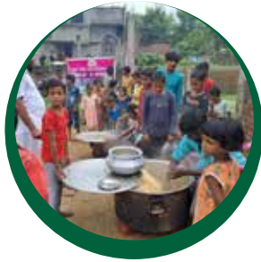
Ramadan & Eid