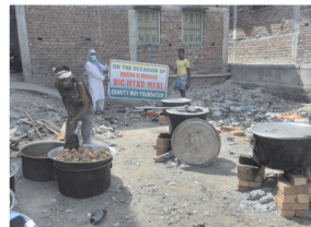
Big Meal preparation during Ramadan