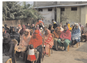
Parents Meeting at An-Noor English School