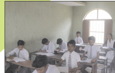
Examination at An-Noor English School