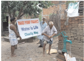
Handpump for drinking water