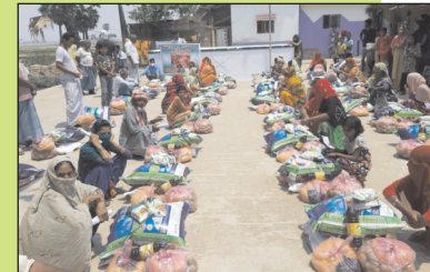
Covid-19 Relief Distribution