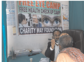
Eye Check-Up Camp