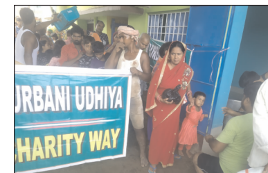
Distribution during Eidul Adha