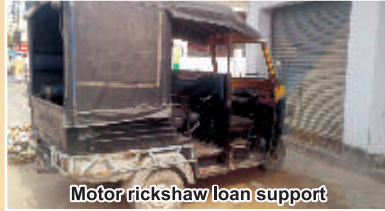
Motor rickshaw loan support