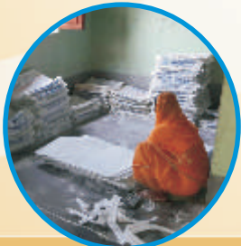
Woman working in bag factory

The Prophet Muhammad (peace be upon him) said: "The believer's shade on the Day of Resurrection will be his charity." [Hadith- Al-Tirmidhi -604]