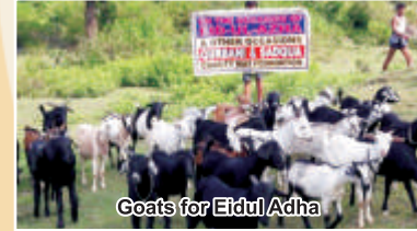
Goats for Eidul Adha