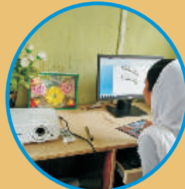
Student using computer at An-Noor English School