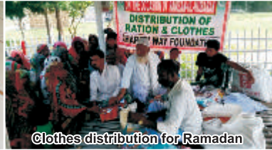
Clothes distribution for Ramadan