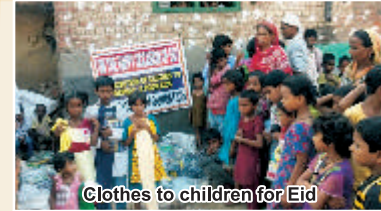
Clothes to children for Eid