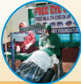
Patient undergoing Eye surgery