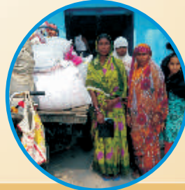
Stipend and Food distribution