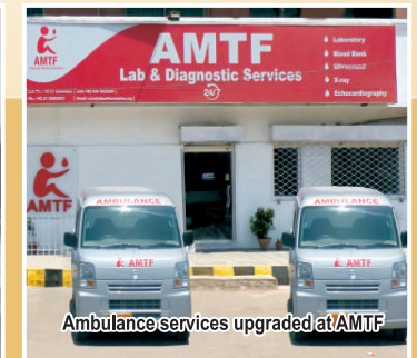
Ambulance services upgraded at AMTF