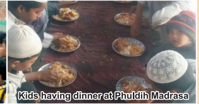
Kids having dinner at Phuldih Madrasa