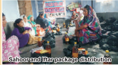
Sahoer and Iftar package distribution