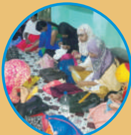
Girls at vocational training center