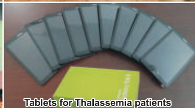
Tablets for Thalassaemia patients