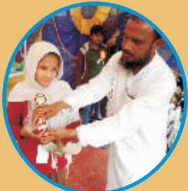
Student receiving award at An-Noor English School