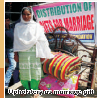
Upholstery as marriage gift