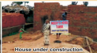
House under construction