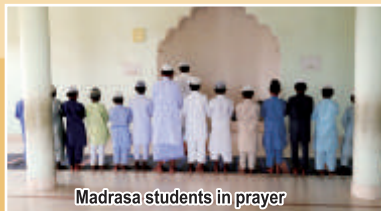
Madrasa students in prayer

Charity Way Foundation began its journey in 1999 with the aim to provide access to basic healthcare and education facilities for the residents of remote villages in the states of Bihar and Jharkhand in India along with Karachi town in Pakistan. In the last eighteen years, support has extended to reach thousands of people in these places through medical clinics, eye surgeries, vaccination, cancer care, school education, coaching and professional development programs, Ramadan and Eidul Adha programs through food and clothing, house and toilet construction, clean drinking water, monthly ration programs, vocational training, marriage assistance, small business, winter clothes' distribution and many others.