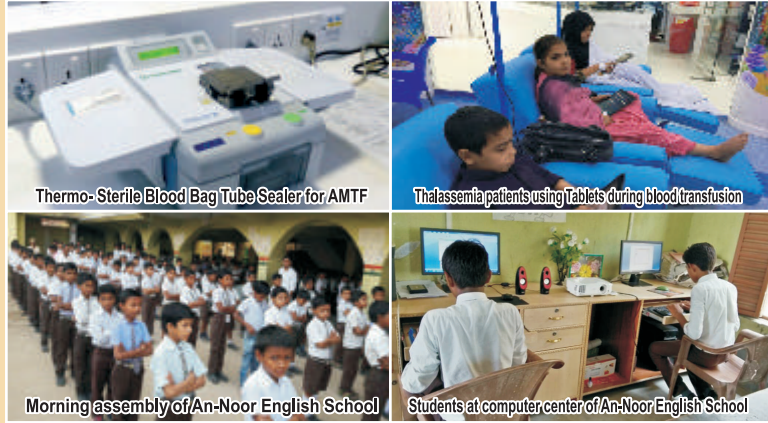
Thermo-Sterile Blood Bag Tube Sealer for AMTF