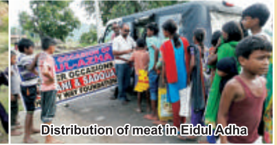
Distribution of meat in Eidul Adha