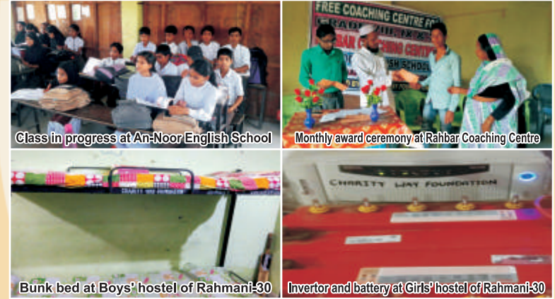
Class in progress at An-Noor English School

In a short span of nine years, An-Noor English School at Jogachak village of Kawakol block in Nawada district of Bihar has become one of the most reputed institutions of the district. The school serves more than 532 students from Play Group to Grade 7 by a team of 22 dedicated teachers. This school provides transportation services to children living in 14 remotely located villages. In the continued effort to provide safe and cold drinking water facility to all students in sweltering heat conditions, one more water cooler system was added to existing two water cooler systems. School is provided with Computer Laboratory and Projector facility to make teaching learning processes seamless on ICT platform in accordance with technological needs. To mitigate shortage of electric supply in the school, an Electrical Generator is added to this facility. The School focuses on