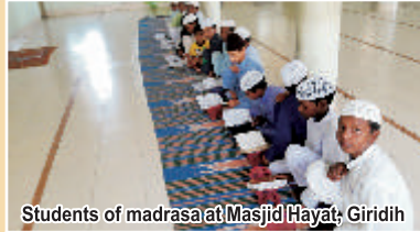
Students of madrasa at Masjid Hayat, Girdih