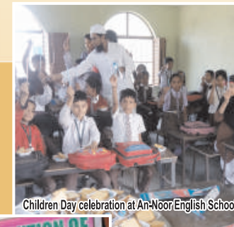
Children Day celebration at An-Noor English School