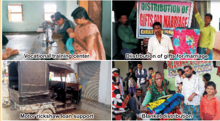
Vocational training center