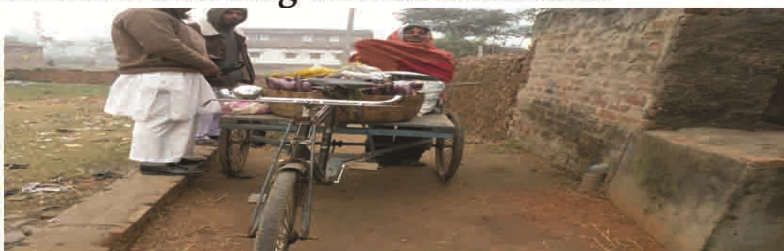
Anas bin Malik reported that the prophet S.A.S said, "Verily, charity appeases the wrath of Allah and eases the suffering of death."